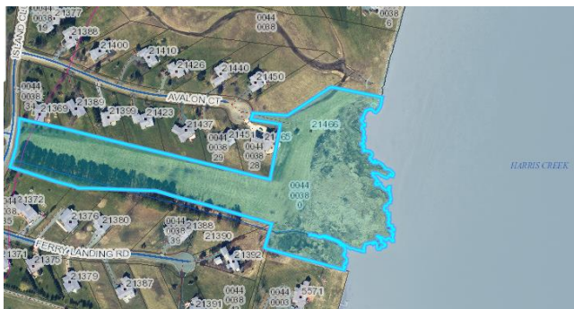
Landing Strip, tree line behind Ferry Landing Road and the wetlands areas - Account ID 2105198240 - Acquired 02/05/2009 (Phase IA)